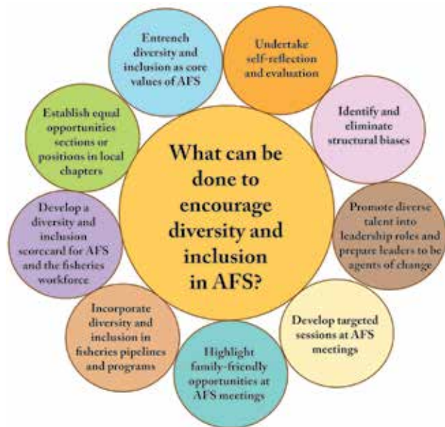
Figure 2. Proposed action areas that can continue to develop diversity and inclusion in AFS.