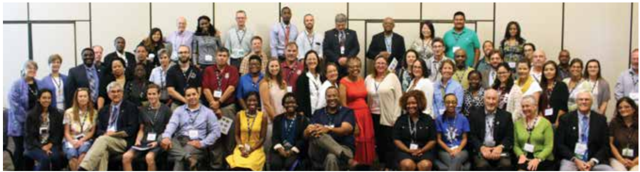
Figure 3. Symposium participants following the symposium entitled “Actions to Increase the Engagement of Underrepresented Minorities in Fisheries and Aquatic Science” in Kansas City, Missouri, August 23, 2016.

(e.g., Mexico Chapter) can also elevate understanding of their programs within the Society. Although there is the Emmeline Moore Prize administered by the Equal Opportunity Section, which is a career achievement award recognizing a member who has provided a strong commitment and exemplary service to the promotion of demographic diversity in the society, fewer women and individuals from underrepresented groups are nominated for awards or receive AFS awards overall. By creating a local climate where everyone is welcome, AFS will fully realize the benefits of diversity by retaining diverse talent.